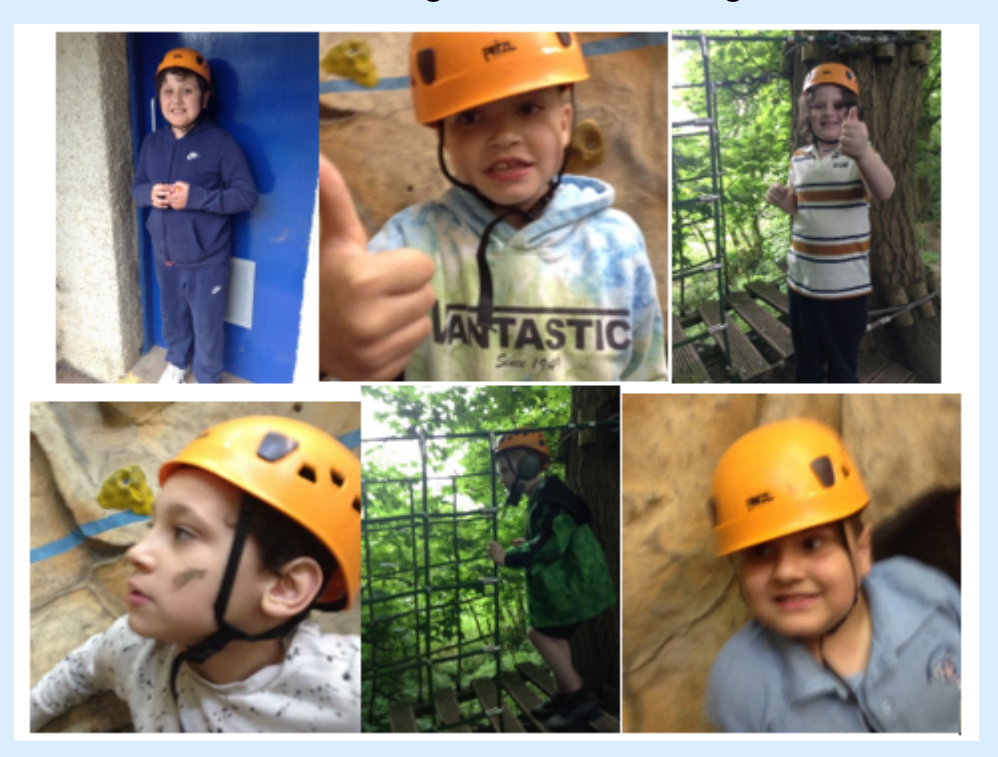
Have a great half-term everyone from Class 400

Class 4 have had another energetic half-term and a lot of function Highlights have included visits to the community, including experiencing a gorge walk and indoor caving at Hothersall Lodge.